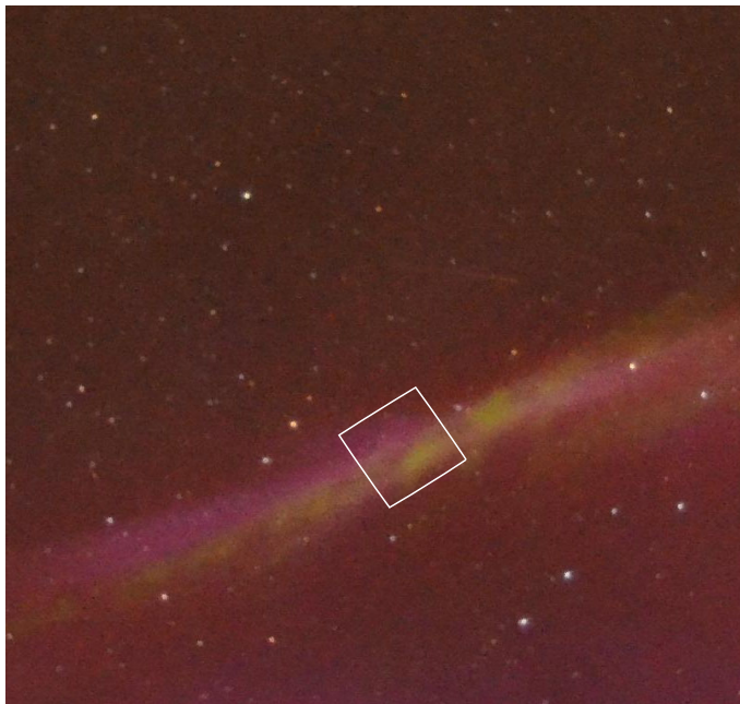
Portion of colour all-sky image